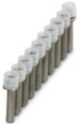
Jumper, pitch: 6 mm, number of positions: 10, color: silver

Please be informed that the data shown in this PDF Document is generated from our Online Catalog. Please find the complete data in the user's documentation. Our General Terms of Use for Downloads are valid ( http://phoenixcontact.com/download )